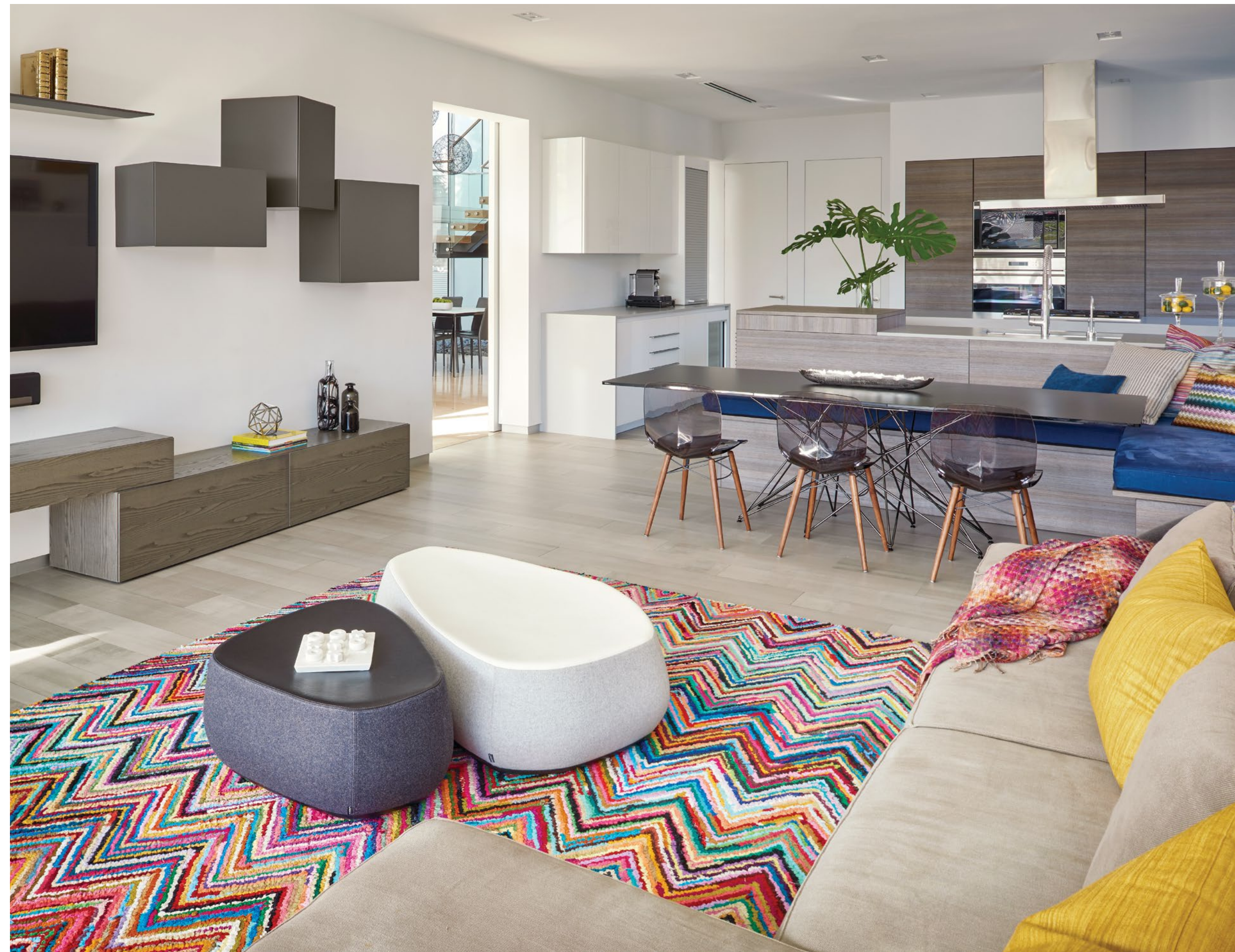
Geometry prevails in the cozy kitchen and family room, where Poggenpohl's cube cabinetry and banquette join Bonaldo's table and side chairs from Addison House. Nearby, cocktail modules by Moroso take center stage, while Missoni's theatrical throw and Surya's woven area rug add a burst of color.